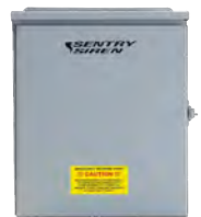
GEN-3 radio controller

Be sure to ask about our full line of siren activation, weather monitoring and communication packages including "Storm Sentry", the world's first fully automatic siren activation system, "S.T.A.R.", our state-of-the-art report-back status monitoring system, and "E.P.I.C.", the world's first PC-based FEMA IPAWS interface.