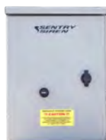
"S" series motor starter

Our "S" series siren motor starters and "Generation" series siren controllers make powering and activating your siren simple and easy. Call us today and let our knowledgeable staff help you select the perfect control solution for your system!