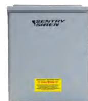
GEN-3 radio controller

Be sure to ask about our full line of siren activation, weather monitoring and communication packages including "Storm Sentry", the world's first fully automatic siren activation system, "S.T.A.R.", our state-of-the-art report-back status monitoring system, and "E.P.I.C.", the world's first PC-based FEMA IPAWS interface.