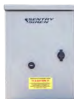
"S" series motor starter

Our "S" series siren motor starters and "Generation" series siren controllers make powering and activating your siren simple and easy. Call us today and let our knowledgeable staff help you select the perfect control solution for your system!