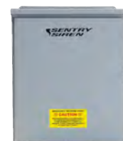
GEN-3 radio controller

Be sure to ask about our full line of siren activation, weather monitoring and communication packages including "Storm Sentry", the world's first fully automatic siren activation system, "S.T.A.R.", our state-of-the-art report-back status monitoring system, and "E.P.I.C.", the world's first PC-based FEMA IPAWS interface.