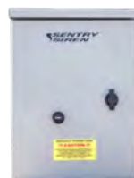
"S" series motor starter

Our "S" series siren motor starters and "Generation" series siren controllers make powering and activating your siren simple and easy. Call us today and let our knowledgeable staff help you select the perfect control solution for your system!