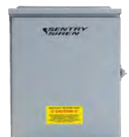
GEN-3 radio controller

Be sure to ask about our full line of siren activation, weather monitoring and communication packages including "Storm Sentry", the world's first fully automatic siren activation system, "S.T.A.R.", our state-of-the-art report-back status monitoring system, and "E.P.I.C.", the world's first PC-based FEMA IPAWS interface.