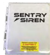
GEN-1 manual controller