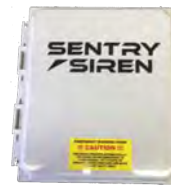
GEN-1 manual controller