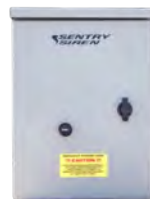
"S" series motor starter

Our "S" series siren motor starters and "Generation" series siren controllers make powering and activating your siren simple and easy. Call us today and let our knowledgeable staff help you select the perfect control solution for your system!