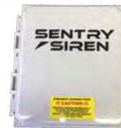
GEN-1 manual controller