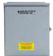
GEN-3 radio controller

Be sure to ask about our full line of siren activation, weather monitoring and communication packages including "Storm Sentry", the world's first fully automatic siren activation system, "S.T.A.R.", our state-of-the-art report-back status monitoring system, and "E.P.I.C.", the world's first PC-based FEMA IPAWS interface.