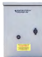
"S" series motor starter

Our "S" series siren motor starters and "Generation" series siren controllers make powering and activating your siren simple and easy. Call us today and let our knowledgeable staff help you select the perfect control solution for your system!